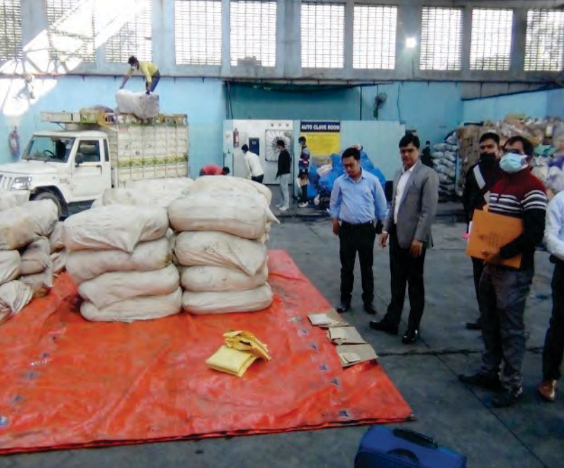
Drug Disposal at Kolkata Zonal Unit