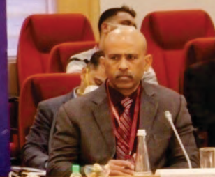
DIRECTOR GE NARCOTICS CONTROL