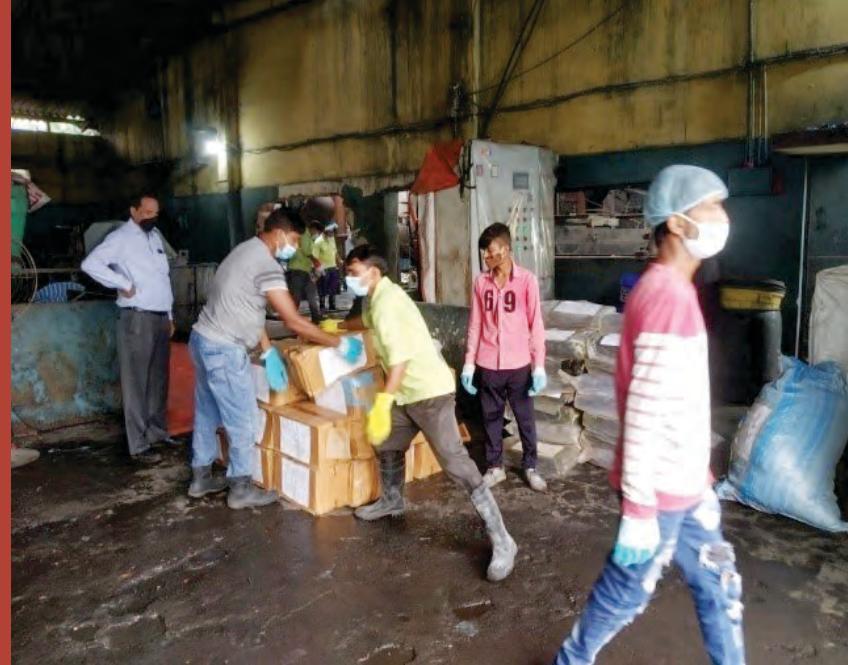
Drug Disposal at Lucknow Zonal Unit