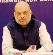
UNION HOME MINISTER