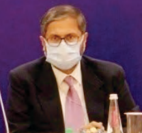
DIRECTOR INTELLIGENCE BUREAU